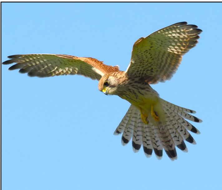
Adult Kestrel - The Angel of the East