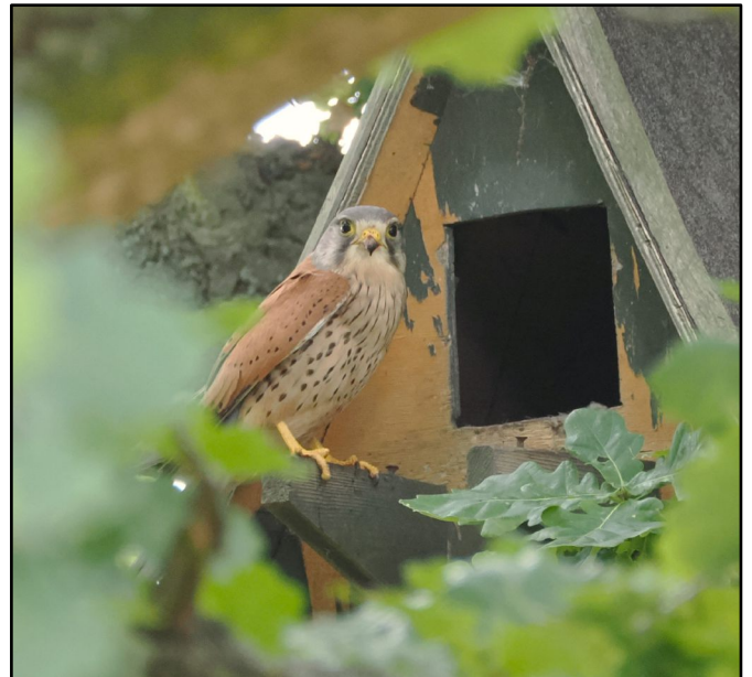
Male Kestrel at the nest box