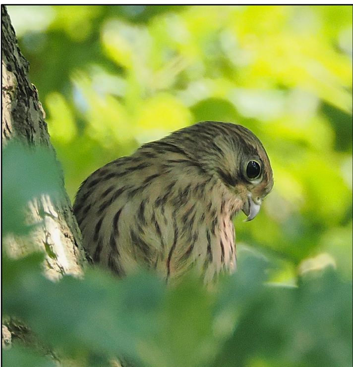
A Bentley fledgling