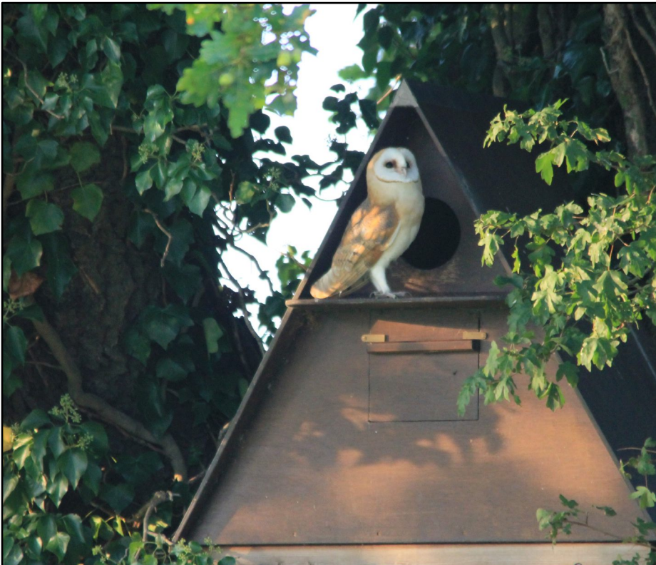
A Barn Owl box in use

The female undertakes most of the incubation of the 4 to 5 eggs with the chicks hatching after about 30 days. The female will brood her offspring for the first two weeks with the male bringing prey to the nesting site. Both adults will then hunt to provide enough food for their growing brood. The young kestrels are ready to fledge at 4 weeks old but will rely on their parents to provide food for a further month whilst they hone their hunting skills.