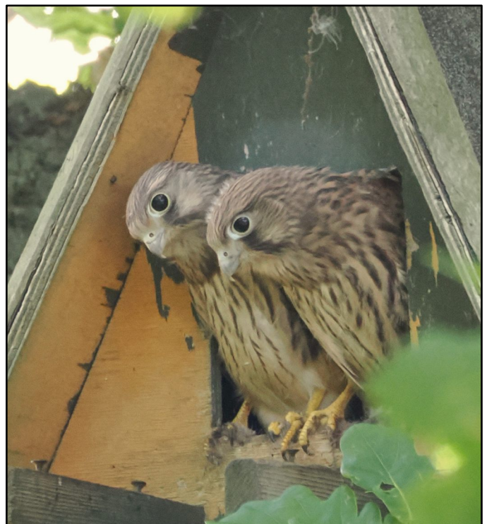
Waiting to be fed