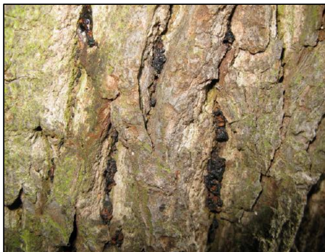
Acute Oak Decline: It's bark leaks a black, sticky tar-like substance