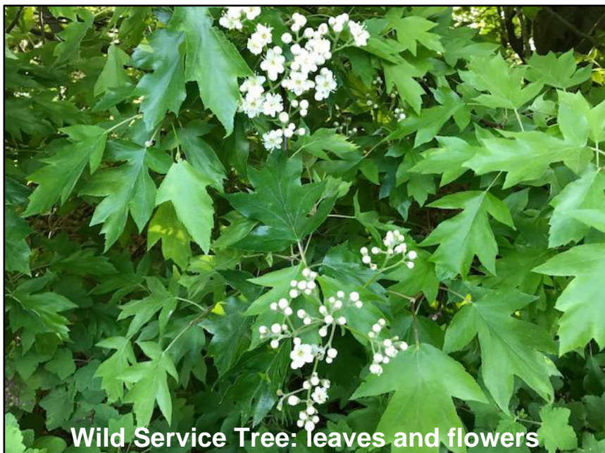
Wild Service Tree: leaves and flowers

Unfortunately, tree disease has seriously affected three of Bentley's Native trees . Elm has been continuously attacked for many years by " Dutch Elm disease ", (a disease carried from tree to tree by a beetle) so that it never grows into large trees. Elms die when they reach a diameter of about 8 to 10 cm.