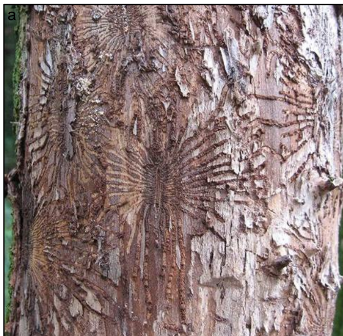
Dutch Elm Disease: Distinctive Elm beetle tunnels beneath the bark

Gone are the huge Elms I was familiar with as a boy.