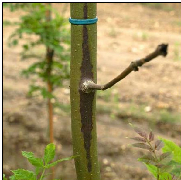
Ash Dieback Disease: Dark: Stem lesions appear and leaves die